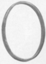
Art. 157/16 Mtl 1/2" x 1/4" 4 1/2" x 6 5/16" Wt. .5 lb.