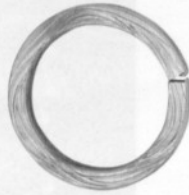
Art. 1317/18 Mtl 1/2" sq. 3 15/16" dia. Wt. .7 lb.