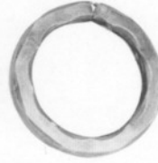
Art. 491/9 Mtl 1/2" sq. 3 15/16" dia. Hammered edges Wt. .6 lb.