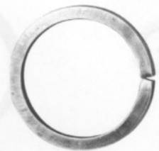
Art. 491/8 (ex 157/1/S) Mtl 1/2" sq. 3 15/16" dia. Plain Wt. .6 lb.