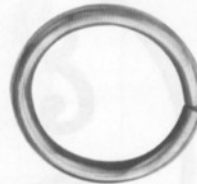
Art. 1317/8 Mtl 3/8" dia. 5 1/8" dia. Wt. .5 lb.