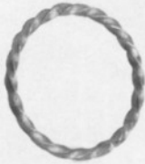
Art. 156/A/6 Mtl 3/16" x 3/16" 2 31/64" dia. Wt. .1 lb.