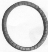
* Art. 156/A/4 Mtl 1/4" x 1/4" 2" dia. Wt. .1 lb.