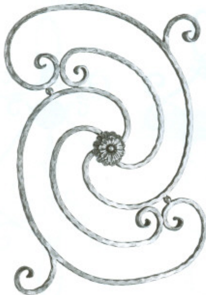
Art. 1039/1 Mtl 9/16" x 9/16" sq. 22 7/16" W x 30" H Wt. 18.7 lbs.