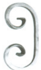
Art. 78/B/4 Mtl 9/16" sq. 4 5/16" W x 8 21/32" H Plain - Wt. 2.1 lbs.