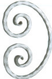
Art. 1039/2 Mtl 9/16" sq. 7 7/8" W x 11 13/16" H Hammered Wt. 3.8 lbs.