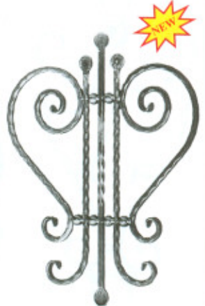
Art. 460/1 Mtl 1/2" sq. 18 1/8" W x 21 21/32" H Hammered Wt. 11 lbs.