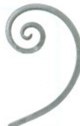
Art. 1038/3 Mtl 9/16" sq. 7 7/8" W x 15 3/4" H Plain - Wt. 2.5 lbs.