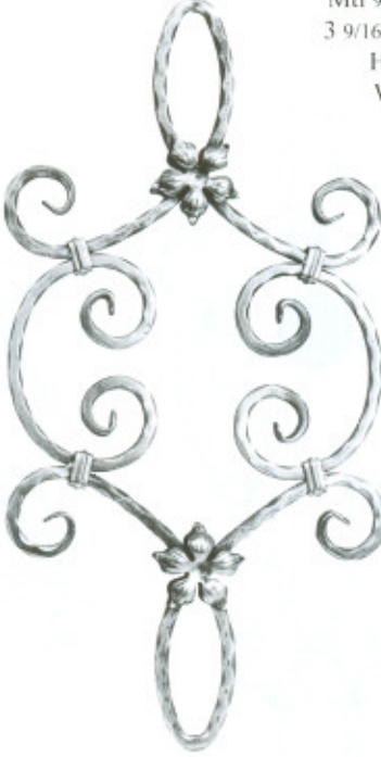
Art. 474/1 Mtl 1/2" sq. 14 31/32" W x 29 23/32" H Hammered Wt. 10.6 lbs.