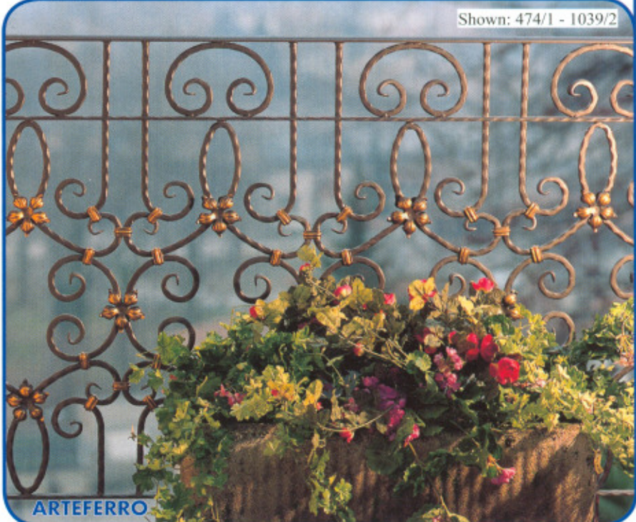
Shown: 474/1 - 1039/2