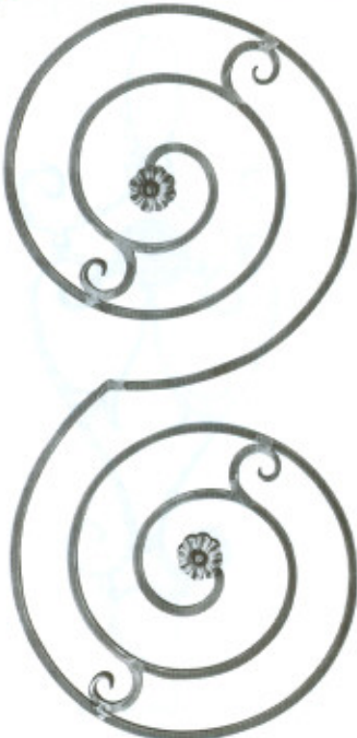
Art. 1038/1 Mtl 9/16" sq. 20 25/32" W x 42 1/2" H Plain Wt. 18.7 lbs.