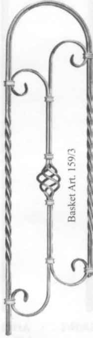
Basket Art. 159/3

Art. 464/1 Mtl 1/2" sq. 9 1/16" W x 35 7/16" H Wt. 7.2 lbs.