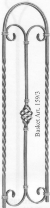
Basket Art. 159/3

Art. 464/1 Mtl 1/2" sq. 9 1/16" W x 35 7/16" H Wt. 7.2 lbs.