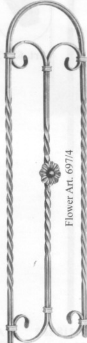
Flower Art. 697/4

Art. 464/2 Mtl 1/2" sq. 9 1/16" W x 35 7/16" H Wt. 6.7 lbs.