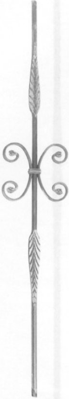
Art. PC44/2 Mtl 9/16" dia. H 44 3/32" Wt. 3.45 lbs.