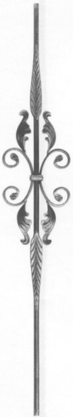
Art. PC44/1 Mtl 9/16" dia. H 44 3/32" Wt. 4.3 lbs.